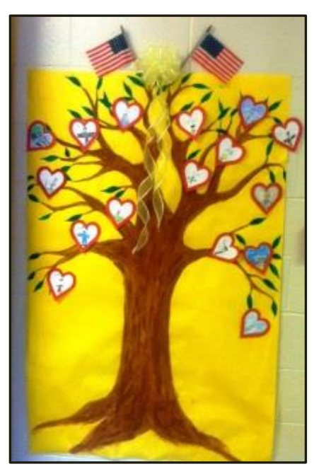
Our Heroes' Tree adorning the wall on Valentine's Day, West Point Elementary School