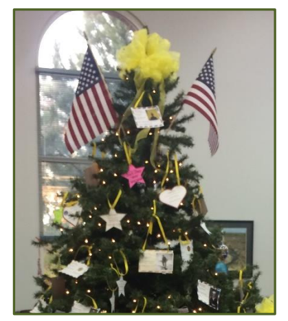
Twin Falls (Idaho) Public Library honors its Véterans with photo-decorations

website or American Forests website for information. Light refreshments