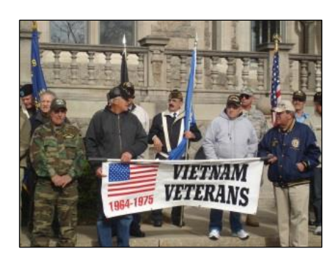
Veterans Day parade, Fairhaven, MA, hosted Our Heroes' Tree