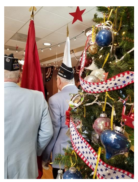
Saluting Veterans at Citizens Care and Rehabilitation Center and Montevue Assisted Living, Frederick, Maryland

Website: www.ourheroestree.com Facebook: Our Heroes' Tree Program