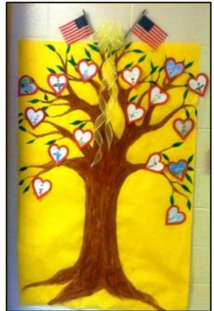
Our Heroes' Tree adorning the wall on Valentine's Day, West Point Elementary School