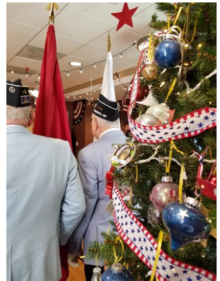
Saluting Veterans at Citizens Care and Rehabilitation Center and Montevue Assisted Living, Frederick, Maryland