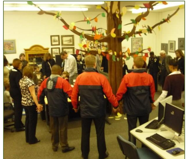
Our Heroes' Tree celebration indoors in winter, Ft. Wainwright, Alaska