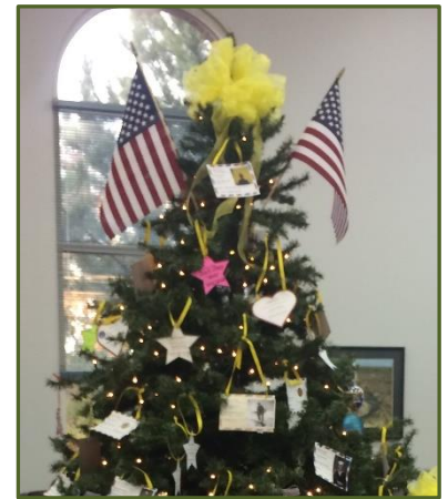
Twin Falls (Idaho) Public Library honors its Veterans with photo-decorations